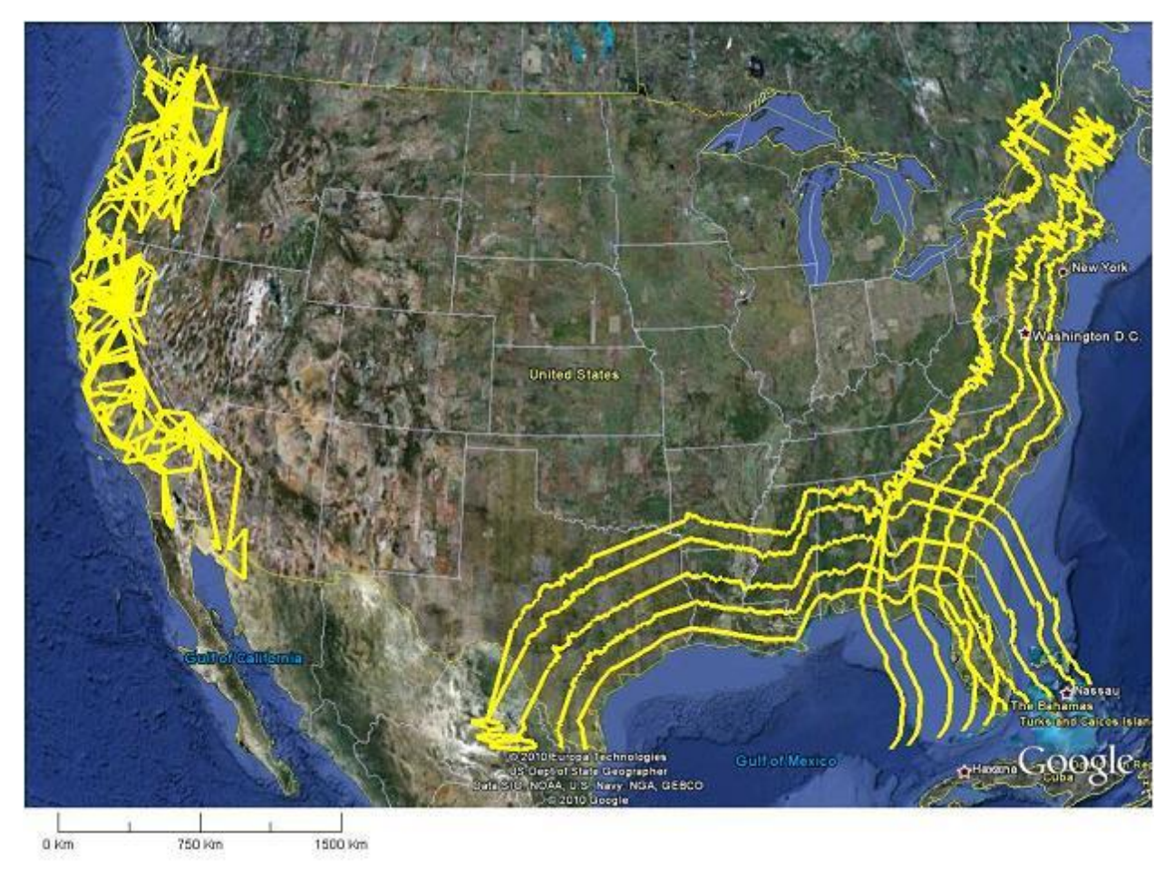
Figure 2. Composite Depiction of Exclusion Zone Distances, Shipborne Radar Systems