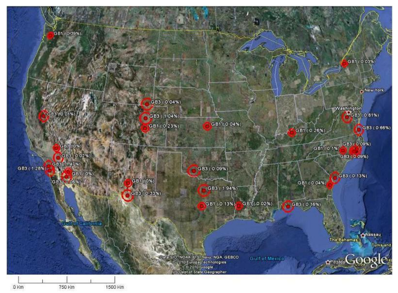
Figure 1. Ground-Based Radar Exclusion Zones, Lower 48 States

systems.<sup>9</sup> Figure 1 shows the exclusion zones for the ground-based radar systems where commercial service cannot operate.