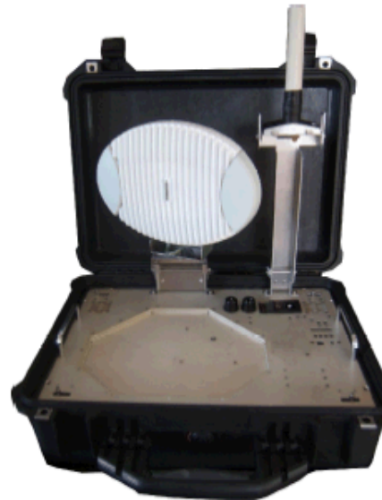
Figure 4- The ERIC system

Compatibility to both existing and emerging technologies is an inherent capability within this system. The system can interconnect with any communications technology that has an existing POTS, PSTN, PBX, VOIP (ASTERISK compliant) and/or ISDN interface. However, the ERIC system has been specifically designed to reach-back to