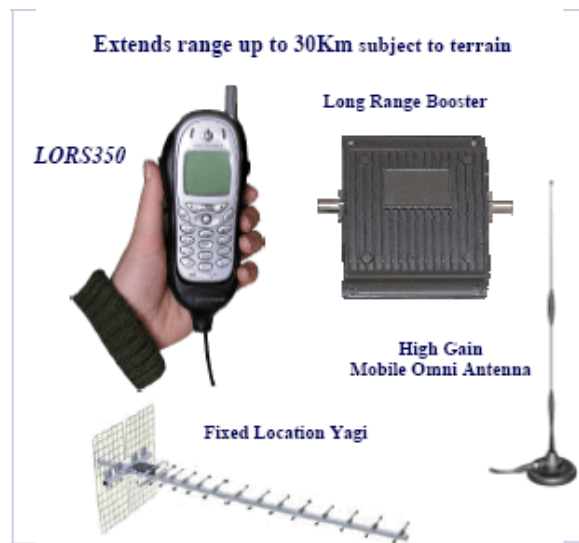
Figure 6- Small STE and Booster

For absolutely maximum coverage (50miles +) it is possible to install the ERIC system onto an airborne platform such a helicopter, airplane or Unmanned Aerial Vehicle (UAV). A purpose-built UAV is currently under development which can remain airborne within a given area for up to 30 hours. This would not only maximize the range of the cell it can also broadcast live images of the affected area directly to users handsets by using the onboard the ERIC system with video.