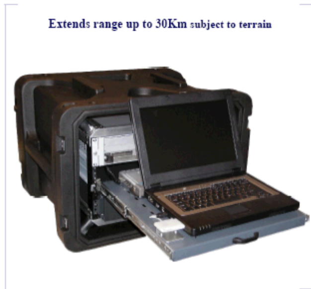
Figure 5- Indoor Unit