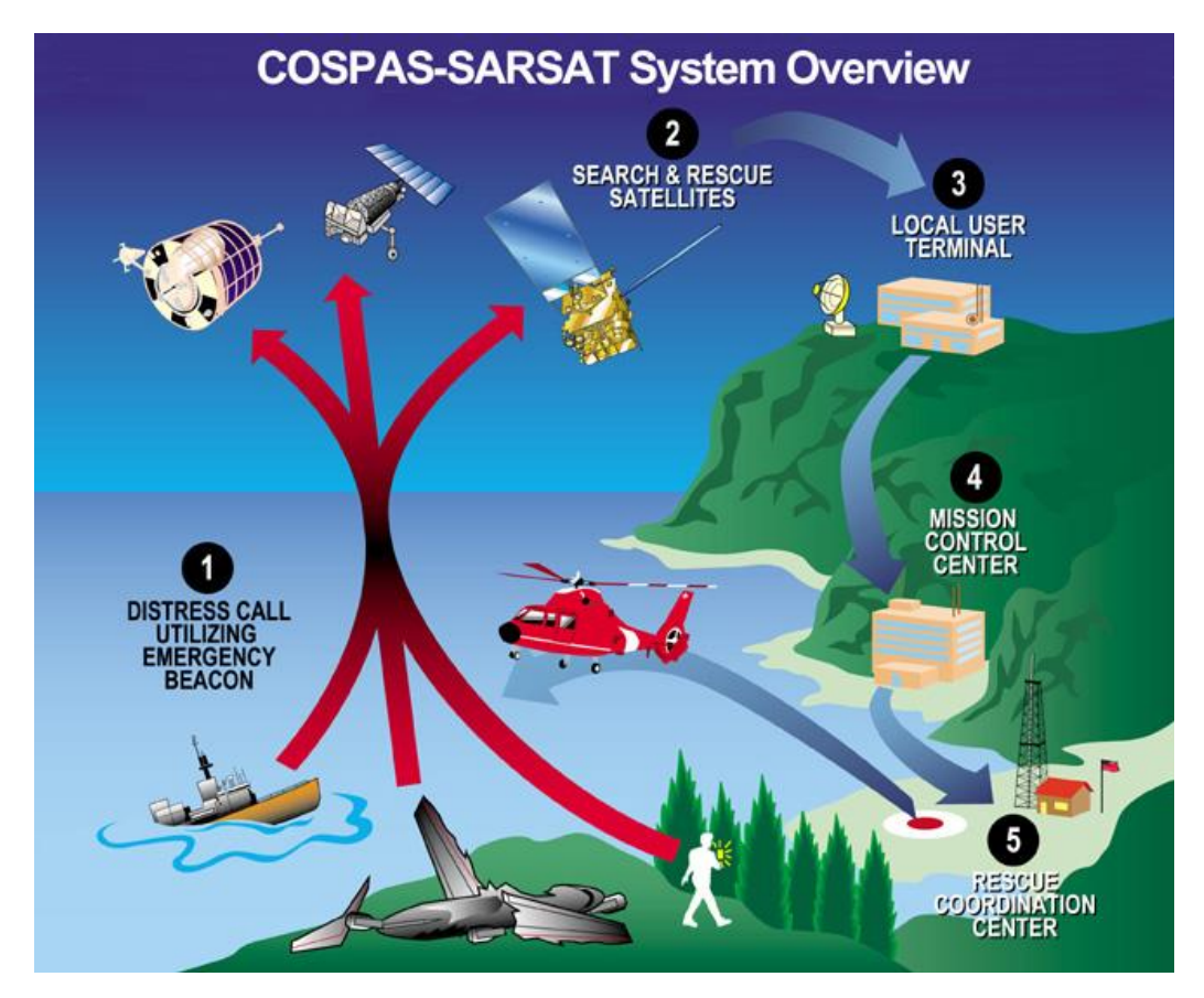
Figure 1. Global Satellite System for Search and Rescue

Figure 1 depicts overview of the SARSAT system. The COSPAS-SARSAT<sup>2</sup> is an international program operated by the United States, Canada, France, and the Russian Federation. The system precisely locates vessels, airplanes, or people in distress. It operates satellites that receive beacon signals from the vessel or person, and transmit the signal to ground receiving stations, referred to as Local Users Terminals (LUTs). Mission Control Centers (MCCs) receive alerts produced by LUTs process the data, then transmit it to Rescue Coordination Centers (RCCs), Search and Rescue Points Of Contacts (SPOCs) or other MCCs.