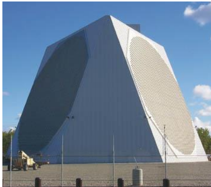
Figure 1. Pave Paws Radar

A Pave Paws radar installation is shown in Figure 1.