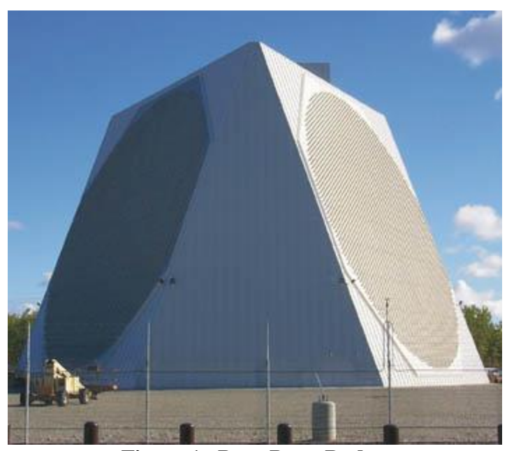
Figure 1. Pave Paws Radar

A Pave Paws radar installation is shown in Figure 1.