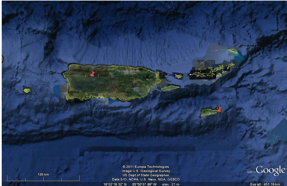
Figure 2. Radio Astronomy Sites in Arecibo, Puerto Rico, and St. Croix, Virgin Islands