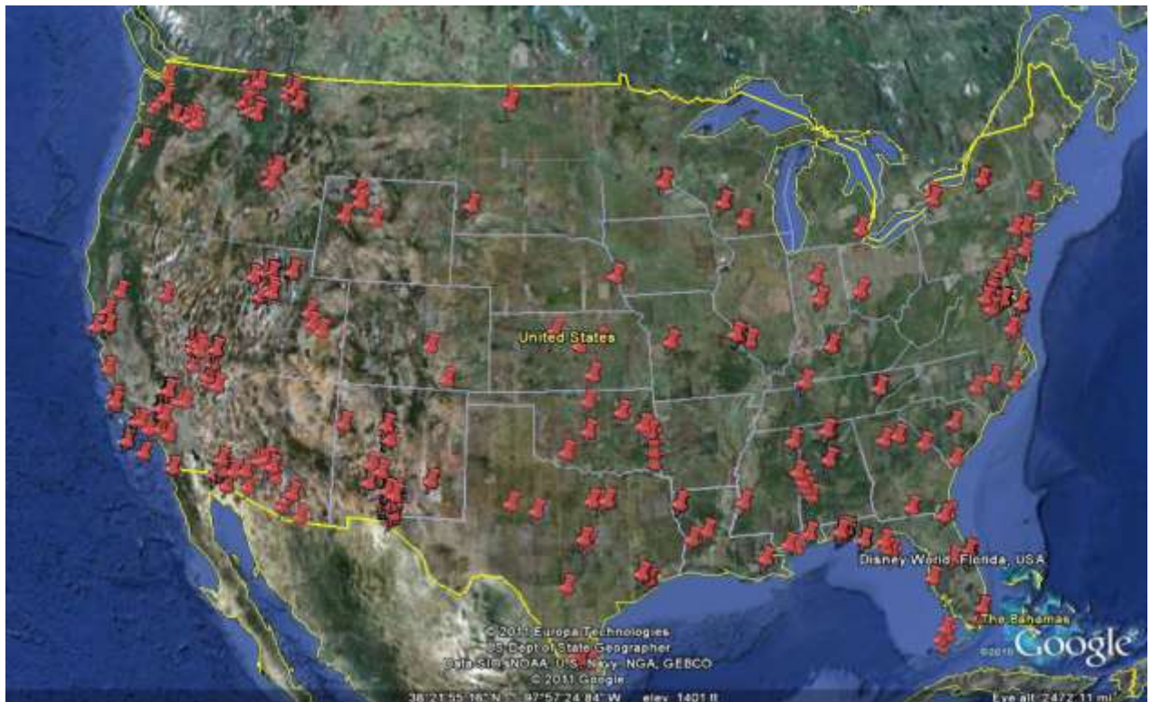
Federal Government Usage in the Continental United States.

Federal agency use in this band includes point-to-point microwave, airborne, and mobile applications. The Dept. of Energy's Western Area Power Administration (WAPA) uses this band for point-to-point microwave relay communications to support their hydroelectric power grid system in a number of western states. The DOD also uses this band to support its backbone, radio relay, testing microwave systems, hydrological and construction operations. The overwhelming majority of operations in this band are for telecommand and telemetry applicable to transmission from devices or equipment to central controller. This band is also used in support of weapons testing, environmental testing for setting new telemetry equipment over a specific distance.