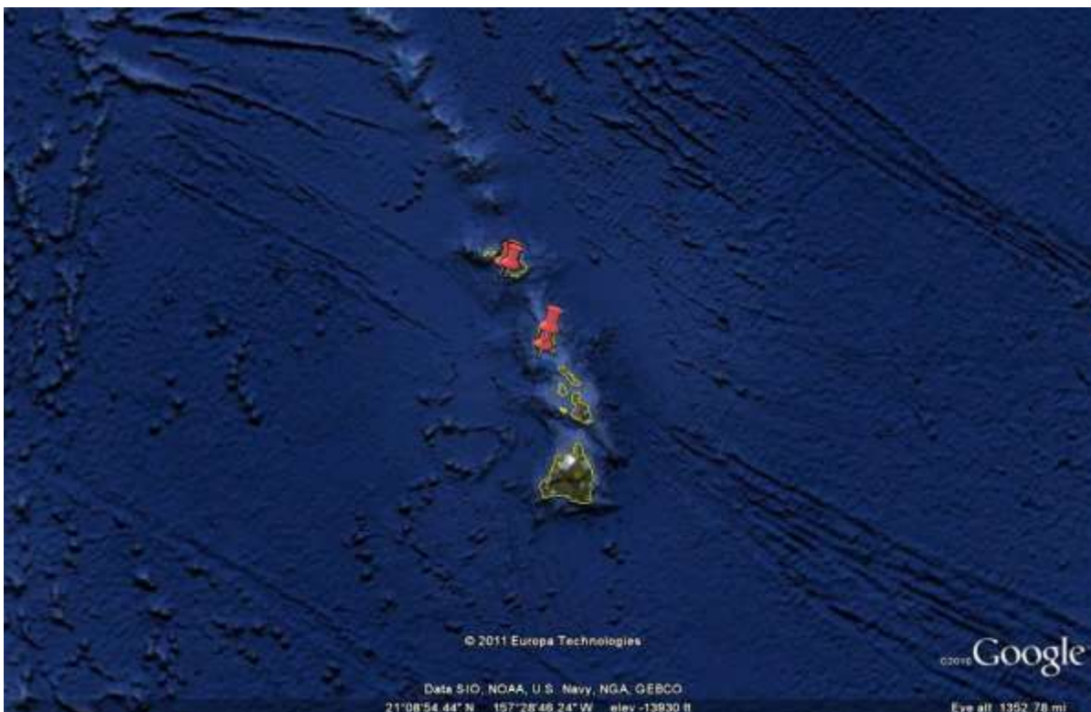
Federal Government Usage in Hawaii