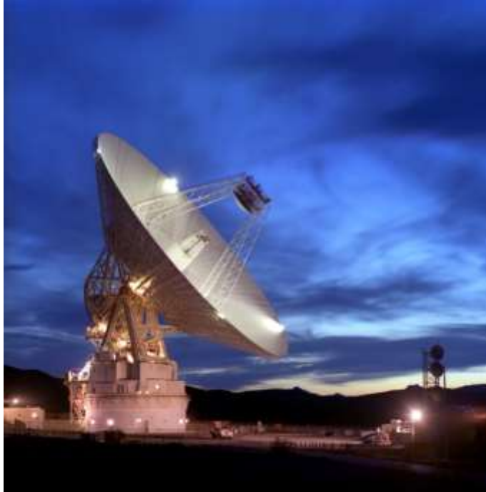
Figure 2. 230-Foot Diameter Antenna at Goldstone, CA 4