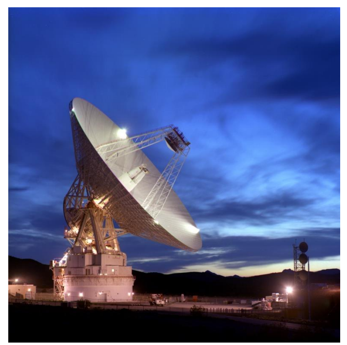
Figure 2. 230-Foot Diameter Antenna at Goldstone, CA<sup>4</sup>