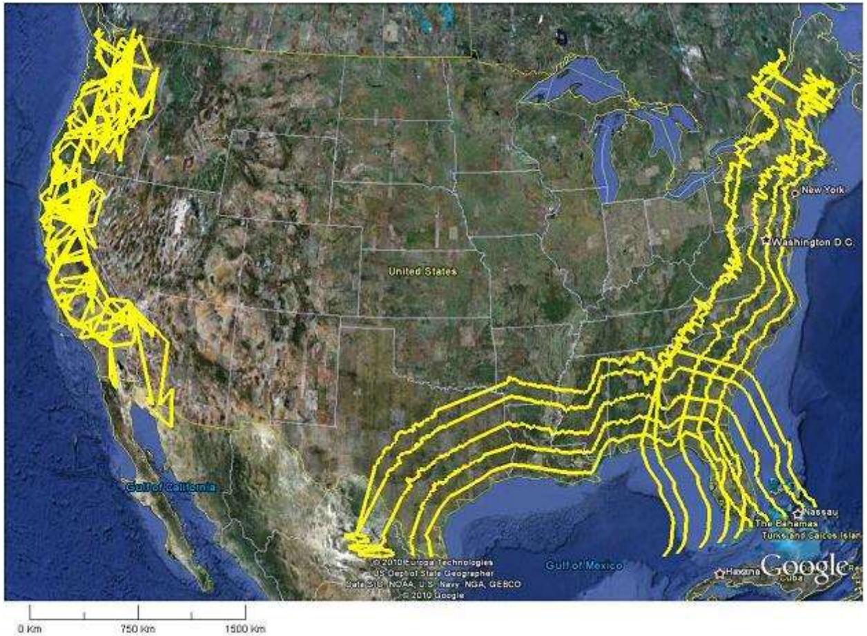
Figure 2. Composite Depiction of Exclusion Zone Distances, Shipborne Radar Systems