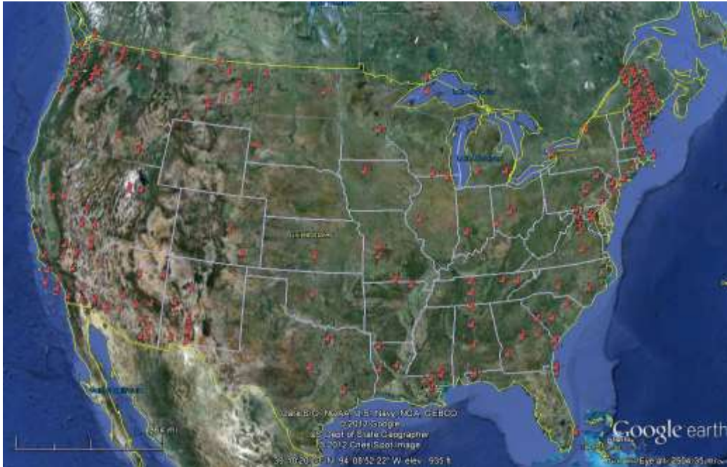
Figure 1: 4400-4500 MHz Federal Government Stations – Continental United States

In addition, the Federal Government operates a number of experimental radio communications in the band for basic research or for the evaluation or testing of electronic equipment or systems that have been developed for operational use. The locations of 4400-4500 MHz Federal Government point-to-point data links in the Continental United States (CONUS) are shown in Figure 1.