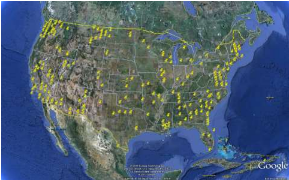
Figure 1: 4500-4800 MHz Federal Government Stations – Continental United States

In addition, the Federal Government operates a number of experimental radio communications in the band for basic research or for the evaluation or testing of electronic equipment or systems that have been developed for operational use. The relative locations of the federal communications systems operating in the 4500-4800 MHz band are shown in Figures 1 to 3.