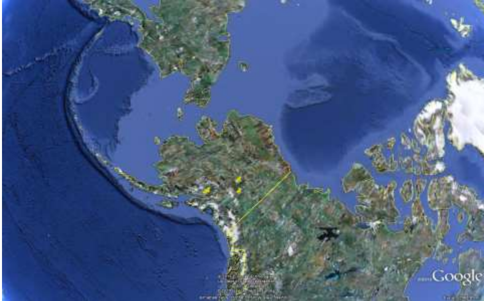
Figure 2: 4500-4800 MHz Federal Government Stations - Alaska