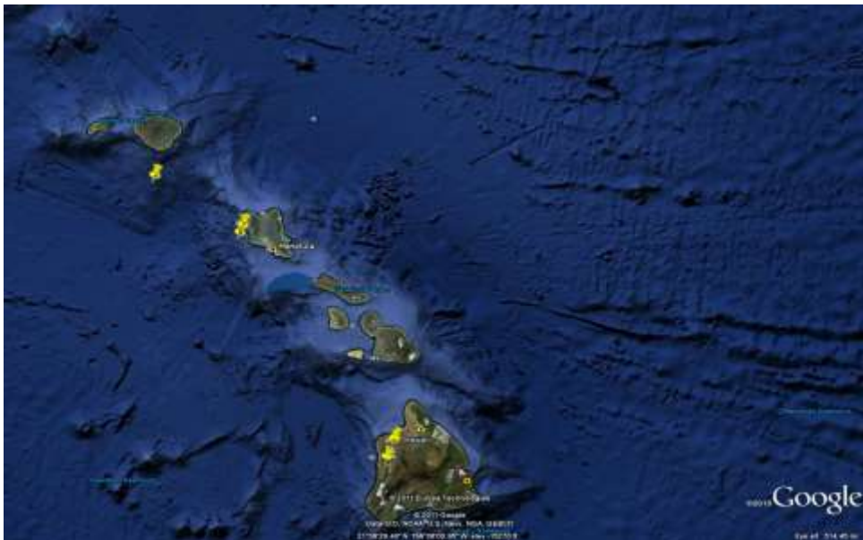
Figure 3: 4500-4800 MHz Federal Government Stations Hawaii