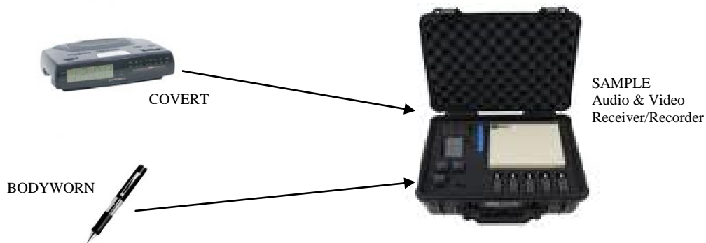
TYPICAL COVERT SURVEILLANCE CONFIGURATION

Both Treasury bureaus are using current Spectrum Relocation Funds (SRF) to convert most of the current “pole cams” to IP-based systems accessible through the internet. IP systems are ideal for longer-term and stationary use, but Treasury still requires use of covert and body-worn video surveillance systems for shorter-term, “on-the-fly” requirements. Manufactures of these systems are still in the process of converting from analog to digital, consequently, current procurements are, and for the foreseeable future, will continue to be a mix of analog and digital systems.