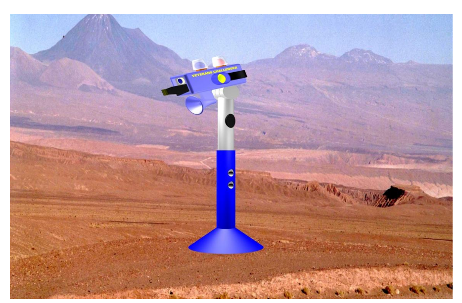
Photo of a prototype tower: Veterans Challenger Border Patrol Homeland Security Device Invented in Chicago

The <u>Department of Homeland Security</u> has a goal to hire about 4000 veterans into the department by the year 2012. Visit <u>www.dhs.gov/veterans</u>