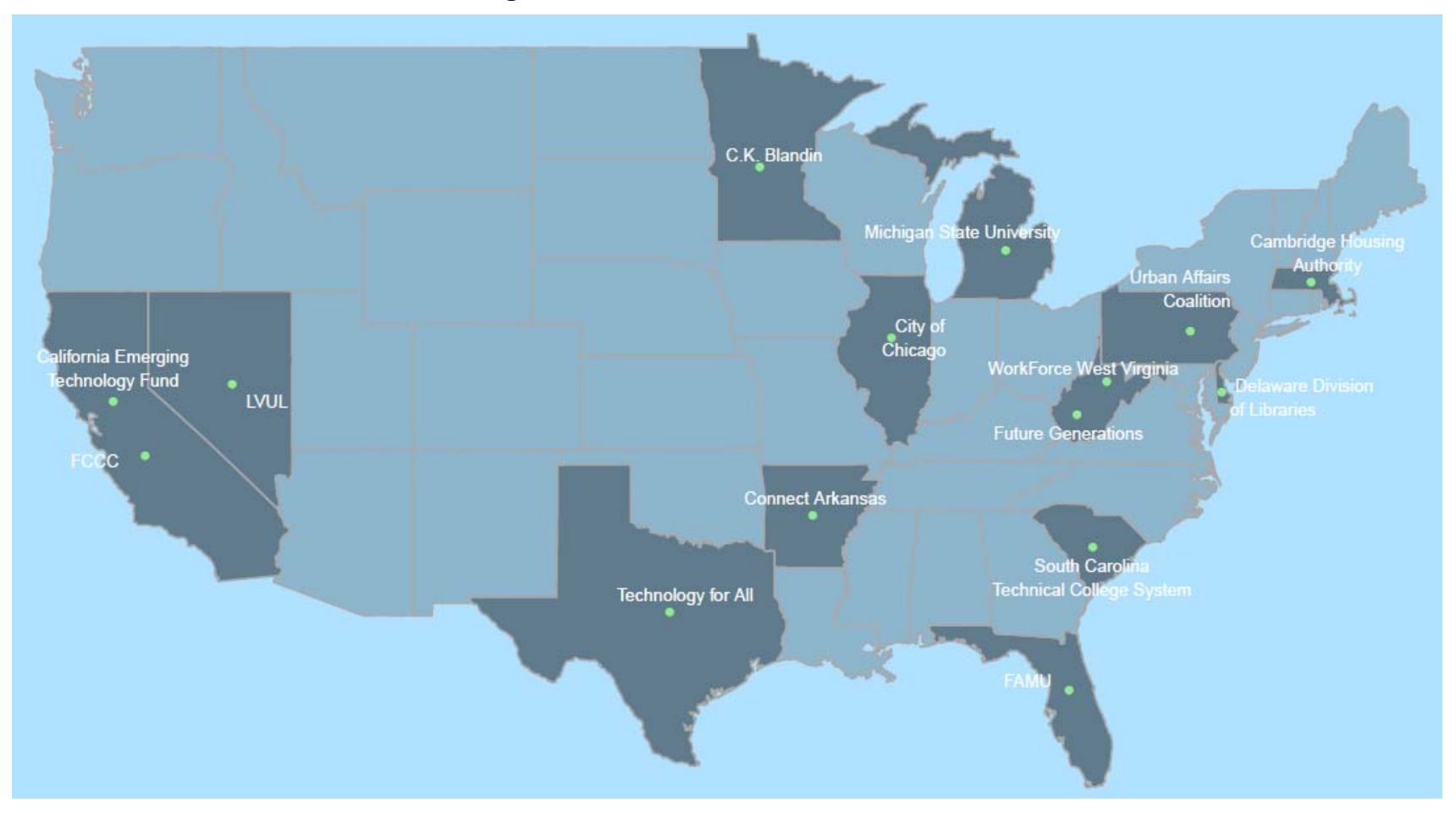
Figure 2. Locations of Selected Grants